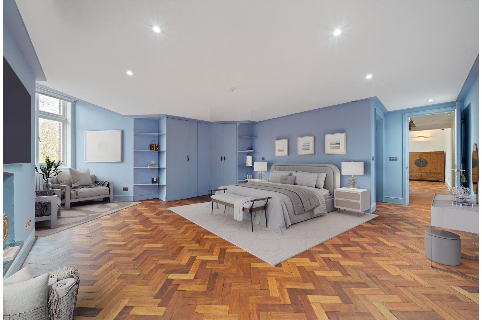
TOP LEFT GUEST TOILET BOTTOM LEFT EN-SUITE RIGHT MASTER BEDROOM