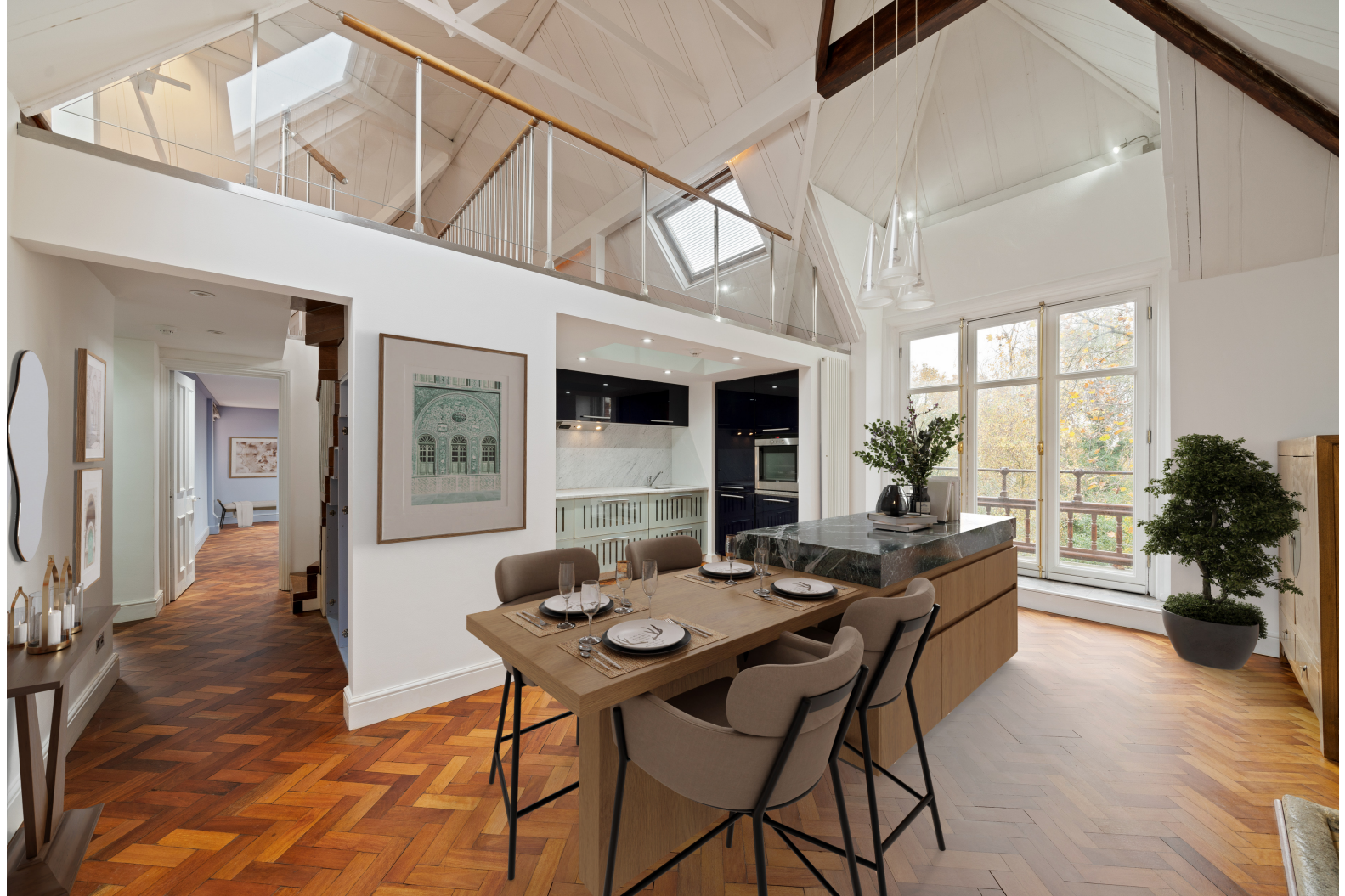
TOP LEFT READING/OBSERVATORY AT THE TOWER BOTTOM LEFT OFFICE AT THE TOWER RIGHT POSSIBLE KITCHEN ISLAND